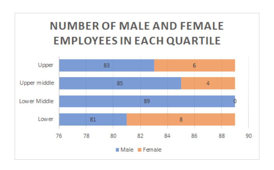
Figure 3 - Quartile Analysis